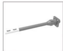
Wind Speed Sensor